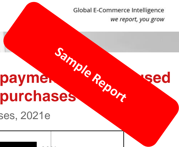
Chile: Top Payment Methods Used, in % of B2C E-Commerce Purchases, 2021e